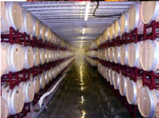
Crown Valley Winery

The Missouri Division of Tourism continues to host press tours as part of its public relations efforts. Three travel writers visited attractions above and below Missouri during the Caves Press Tour, June 5-9. The group visited eight diverse show caves, as well as above-ground attractions in Hannibal, St. Louis, Pulaski County, Lake of the Ozarks, Springfield and Branson.