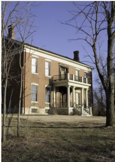
Anderson House Battle of Lexington State Historic Site

Or as Mary Chapin Carpenter likes to quote Mark Knopfler, "Sometimes you're the windshield. Sometimes you're the bug."